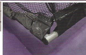
Optional Bottom Frame