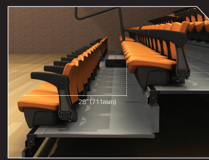
Available with a minimum of 28" (711mm) back to back row spacing