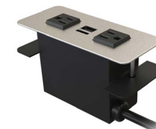
Cove Power Unit