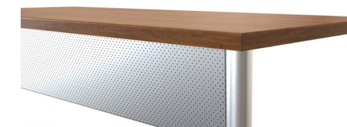
Modesty Panel - Perforated