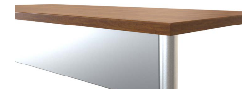
Modesty Panel - Plain