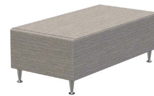
Two Seat, No Back