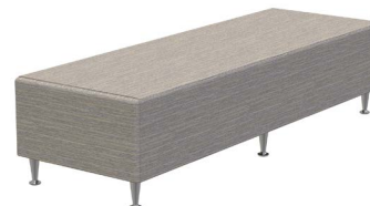
Three Seat, No Back