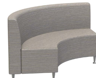
Inner Curve, Upholstered Back