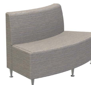
Outer Curve, Upholstered Back