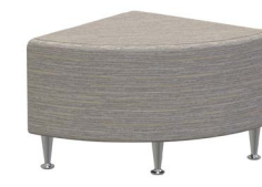
Pie, No Back