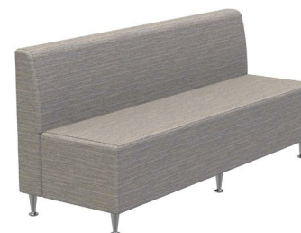
Three Seat, Upholstered Back