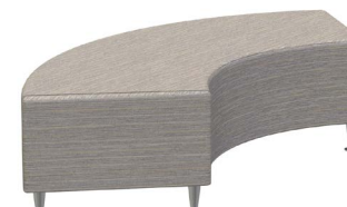
Inner Curve, No Back