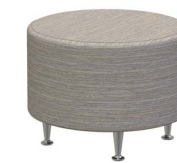
Round, No Back