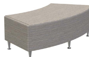
Outer Curve, No Back