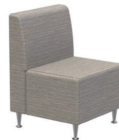
Single Seat, Upholstered Back