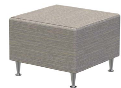
Single Seat, No Back