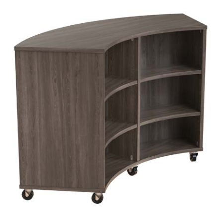
Mobile Double Face, Curve (Inside View)