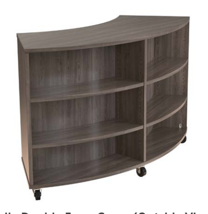
Mobile Double Face, Curve (Outside View)