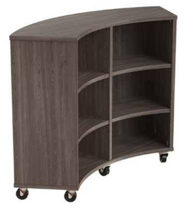
Mobile Single Face, Inner Curve