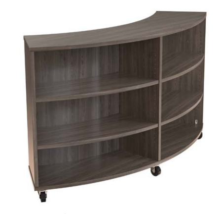
Mobile Single Face, Outer Curve