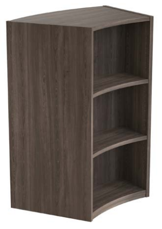
Double Face, Curve (Inside View)