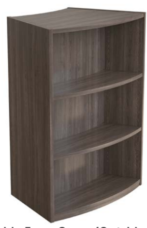
Double Face, Curve (Outside View)