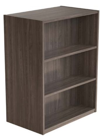
Double Face, Straight