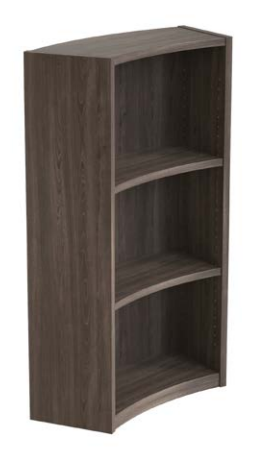
Single Face, Inner Curve