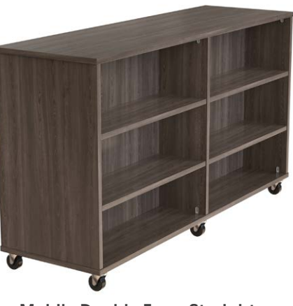
Mobile Double Face, Straight