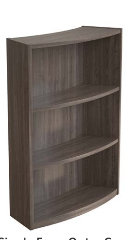
Single Face, Outer Curve