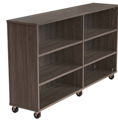
Mobile Single Face, Straight